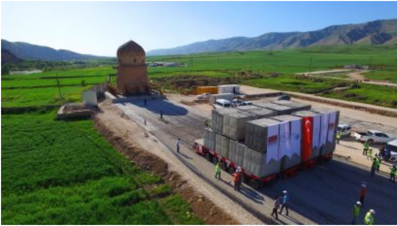
Image 5: Zeynel Bey Tomb during relocation in May 2017

The official claim of rescuing Hasankeyf consists mainly in the relocation of seven monuments to the ‘Hasankeyf Cultural Park’. The preparation for the relocation of the first one, the Zeynel Bey Tomb, started in 2015. The whole process of the relocation was hidden from the public and had no participation by stakeholders, violating existing laws, particularly the tendering and contracting process. With the participation of the Dutch company Bresser Eurasia, the Turkish Er-Bu Insaat could finally relocate the Zeynel Bey Tomb on May 12, 2017. Considering that there is globally no similar relocation experience of a monument of such an age (550 years old) with binding agent technology and the monument is very fragile and in poor condition (there are splits in the cupola) it was a very risky action. Still the monuments stays in its new location, but as no independent experts could examine the monument it is unclear what kind of damage it experienced.