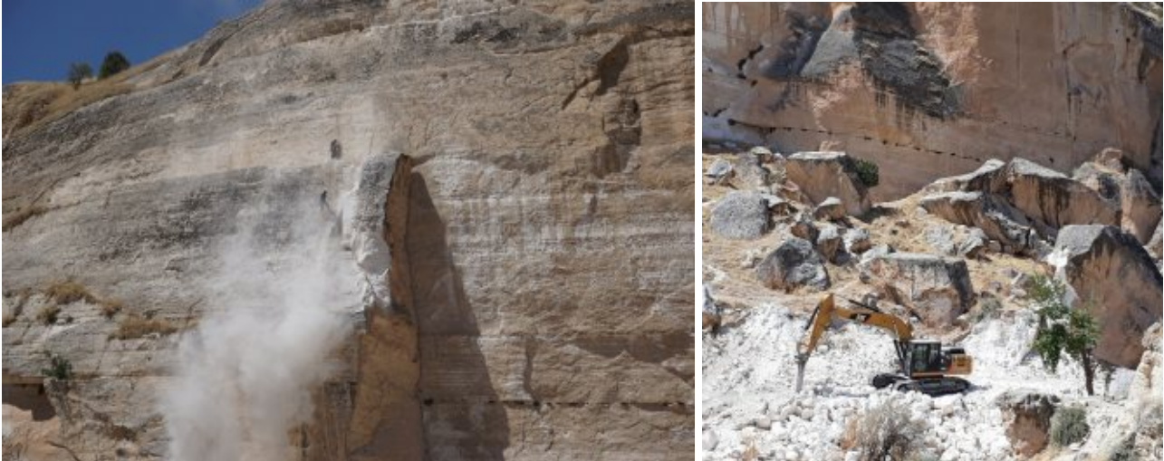
Images 6+7: Destruction of one rocks piece in mid of August 2017; Heavy equipment working with debris; source HYG

Rizk Mosque would be cut and relocated to the cultural park area in New Hasankeyf 11 . Apart from the bridge one more monument has been covered by stones as a ‘restoration and rescue’ work. However, despite these so called ‘rescue projects’ several hundred monuments would be submerged and with time under water destroyed. Now the relocated seven monuments are situated close to each other what they have not done for hundreds of years and disconnected from the original environment. That is why it is a museum and nothing more.