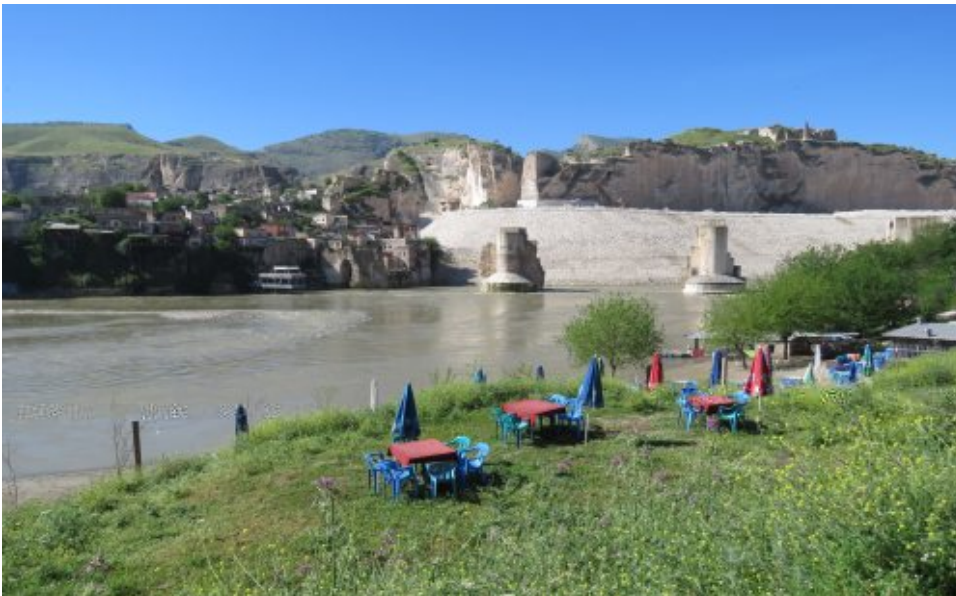
Image 8: The new dam around the Castle Rock

In 2019 the dam around the Castle Rock has been completed and rises into the landscape of Hasankeyf. Its official aim is to ‘consolidate’ the Castle Rock which would be destroyed by surrounding water by time as it is composed by chalk. This chalk was the reason for the fascinating morphology of the Tigris Valley.